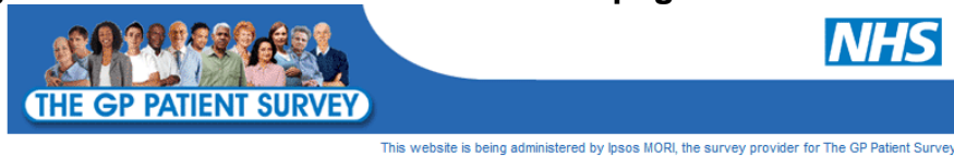
Figure 4.2: The GPPS website welcome page

The full website was launched on 8 January 2008 in parallel with the Access survey going live. The same website was used for both Access and Choice; visitors to the site could select the part of the survey they wanted to visit on the welcome page. Figure 4.2 below shows this page.