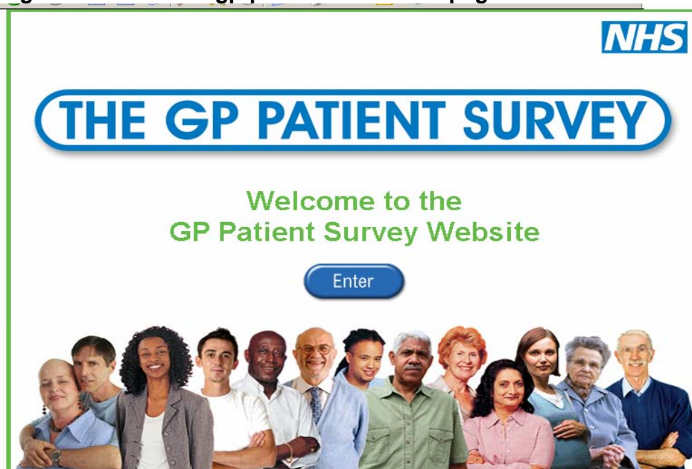
Figure 4.1: the www.gp-patient.co.uk front page

A dedicated survey website was designed and hosted by Ipsos MORI. The advertised web address was www.gp-patient.co.uk , although the site could also be accessed at www.gp-patient.com , www.gppatient.co.uk and www.gppatient.com . The site was designed to reflect the branding of the questionnaire and all other related material, such as the practice poster and leaflet.